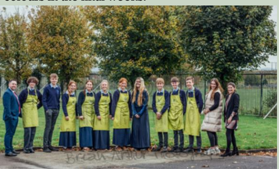
What students said..."Yes absolutely, it is fun, enjoyable and useful for future job opportunities. Well worth checking out"