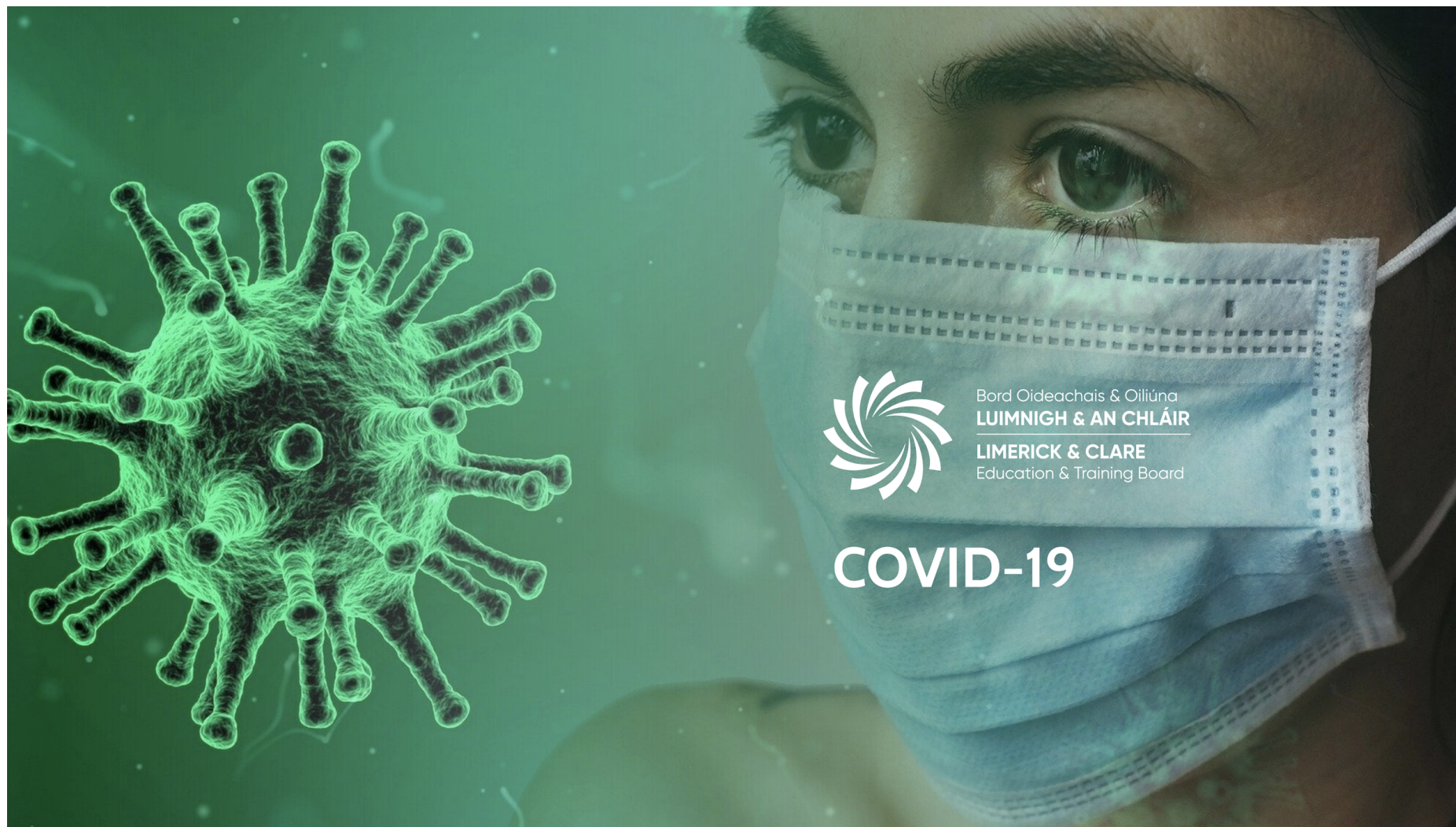
COVID-19 Response Plan for the safe and sustainable reopening of St. Anne's Community College, Co. Clare.